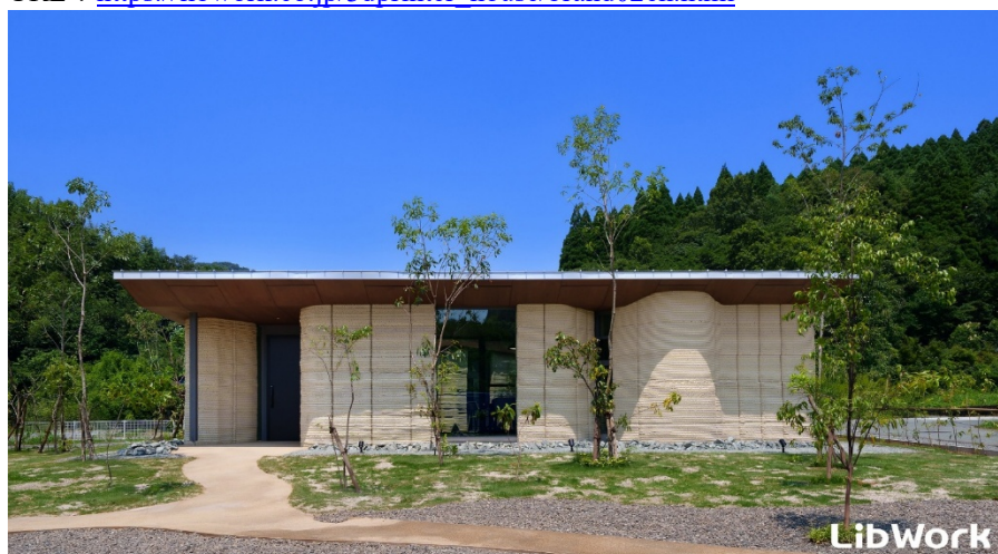
Exterior of Lib Earth House Model B

URL : https://libwork.co.jp/3dprinter_house/brand02en.html