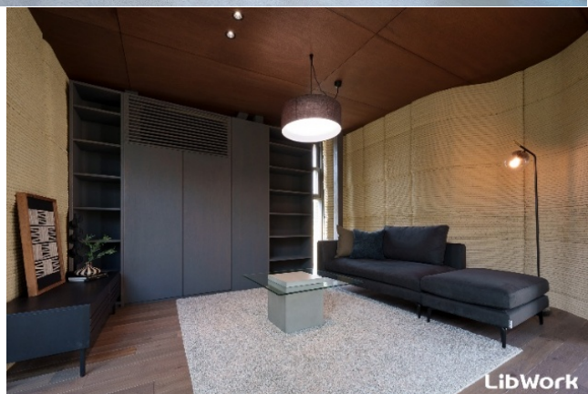
Interior of Lib Earth House Model B